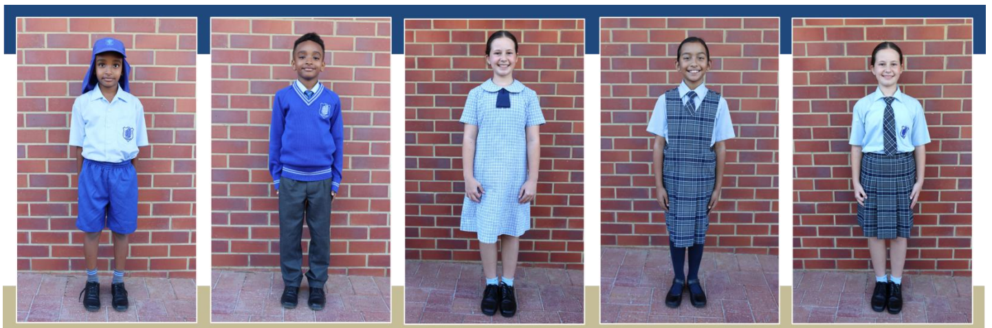
Year 1-6 Boys Summer