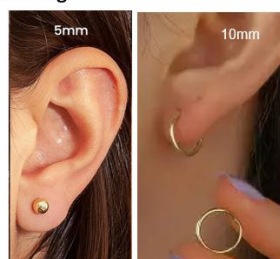
Examples of Acceptable Earrings:

No other visible body piercings are allowed, and covering them with band-aids, tape, bright-coloured plugs or similar items is not acceptable.