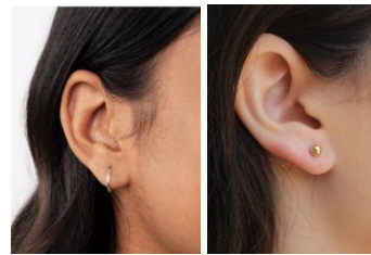
Examples of acceptable earrings