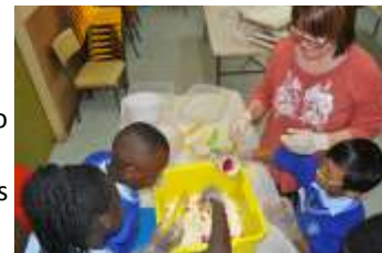
The Eagle's Wings Slice

Sale earned $420 which was a cracking effort! They saw a problem and responded with the eyes of Christ. With the help of year 6 selling leftovers, funds raised came to $561.10!! Congratulations on a job well done!