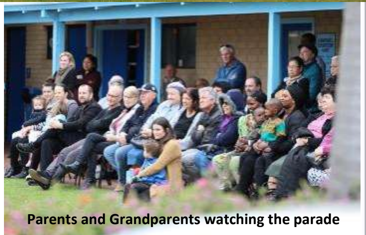
Parents and Grandparents watching the parade