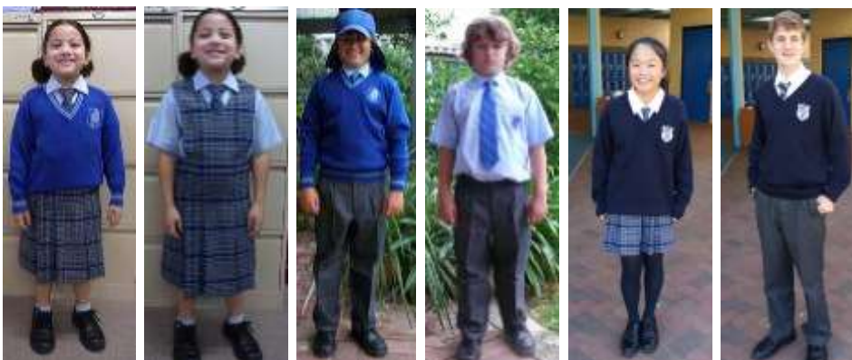
Primary winter Uniform