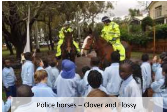
Police horses – Clover and Flossy